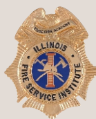
DIRECTOR, ILLINOIS FIRE SERVICE INSTITUTE

Thank you for your support of the Illinois Fire Service Institute. It is my pleasure to support our mission of Helping Firefighters Do Their Work Through Training, Education, Information, and Research.